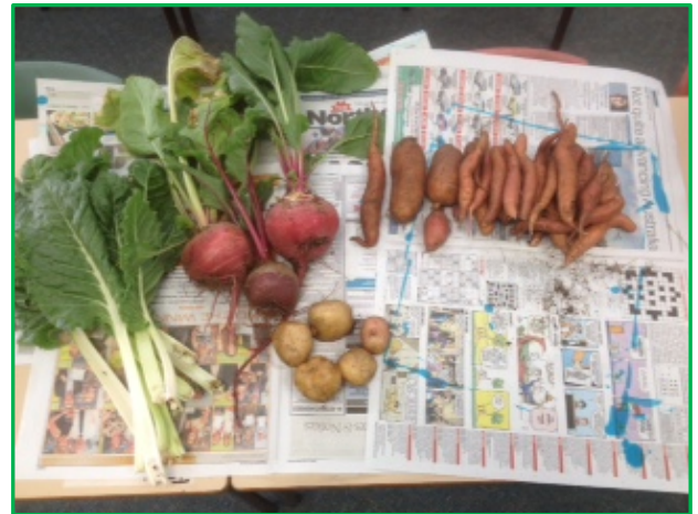
Produce from our vegie patch