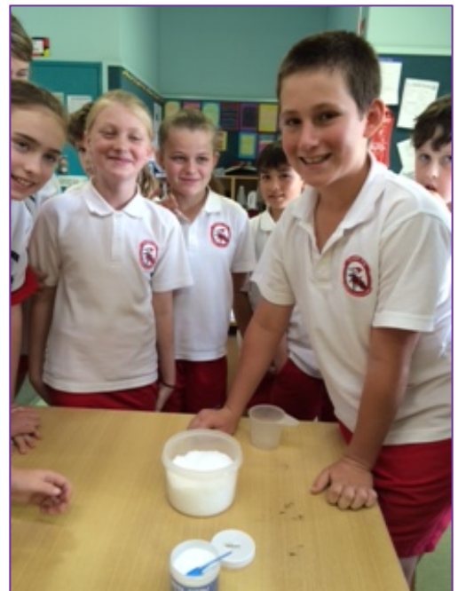
Year 6 experimenting with Science