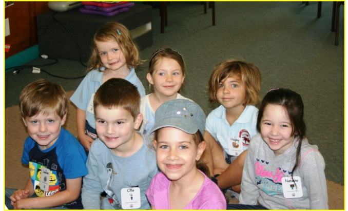
Our excited and slightly nervous new students who attended their first Kinder Orientation session