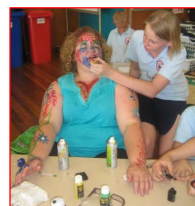
The COOSH Team