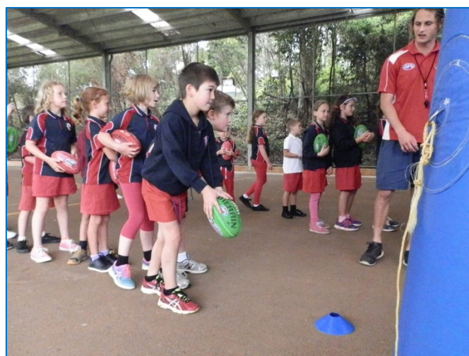
More AFL photos