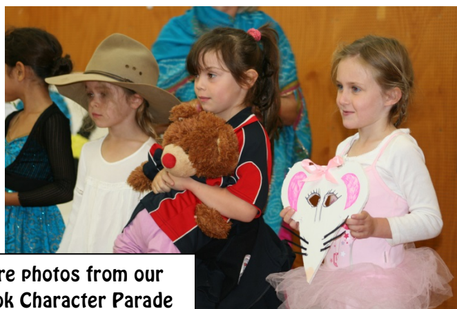
More photos from our Book Character Parade