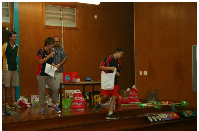
Olympathon Prizes galore!