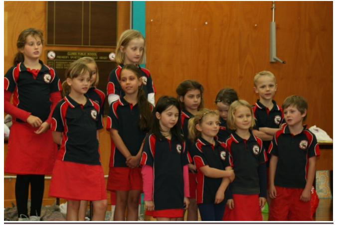
Class 1-2 Assembly item