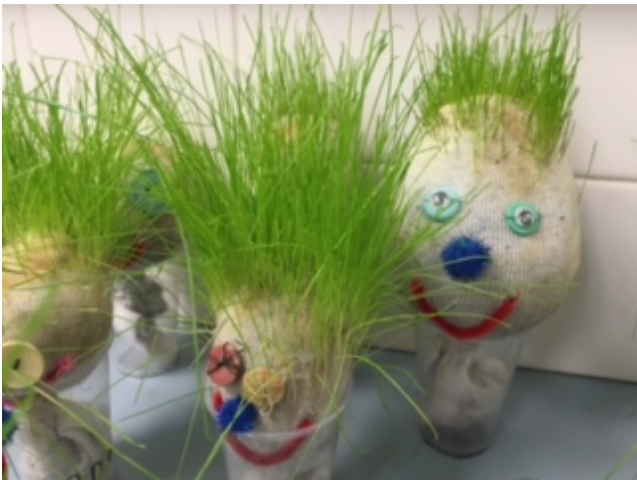
Class 1-2 Plant Heads