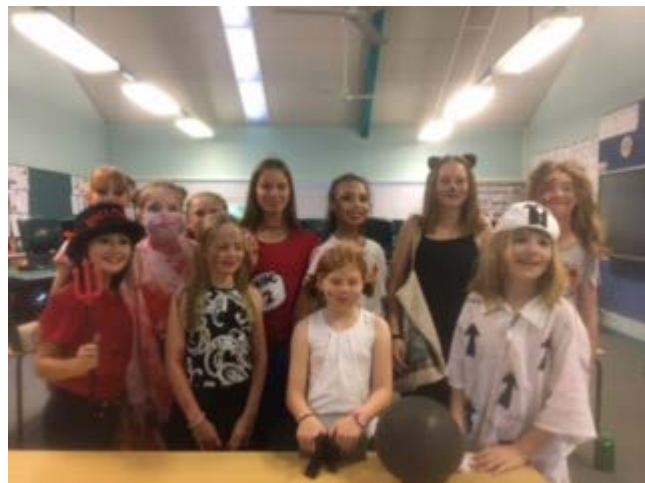
Some scary visitors to the school on Halloween!

NAB AFL Auskick is the national AFL introductory program for primary school kids and their families. Auskick is on again in 2017 at Clunes Public School during term 4 on Monday afternoons starting 6 th November, 3.00pm-4.00pm. Students will receive more information at the school early in term 4. You can also register at www.aflauskick.com.au