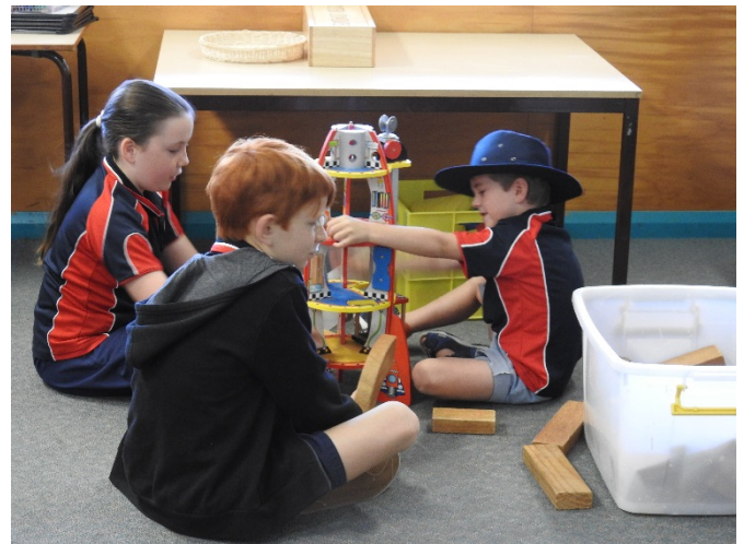
Year five students enjoying their Kinder buddy roles