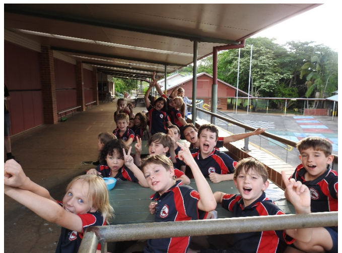
3-4 Class Night Sky Incursion