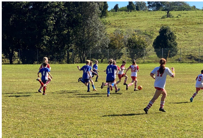
Our soccer team